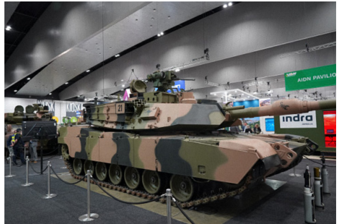
An M1A2 SEP v3 at Land Forces 2024.