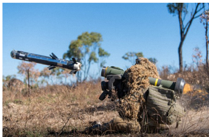
3rd Battalion, Royal Australian Regiment's Direct Fire Support Weapons Platoon fire a Javelin weapon system.

Australia first selected the Javelin in 2002. That year, the DSCA approved a possible sale of 92 Command Launch Units (CLU) and 666 rounds to Australia. Since then, Defence has periodically refreshed the Australian Army's stock of missiles, most recently in March 2023 when the DSCA approved a sale of 255 FGM-148Fs.