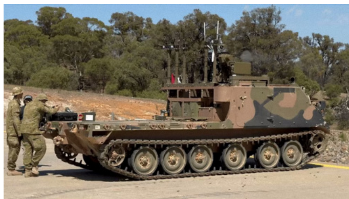
An armed M113 Armoured Personnel Carrier during long-range firing trials in Victoria.