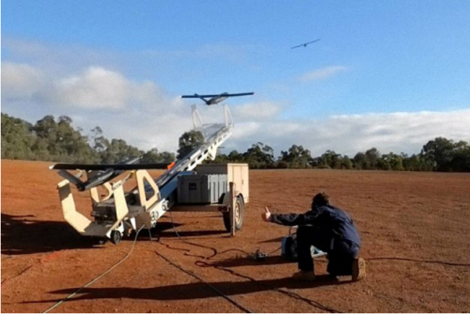
Innovaero's OWL-B is launched from Insitu Pacific's Mark 4 Launcher