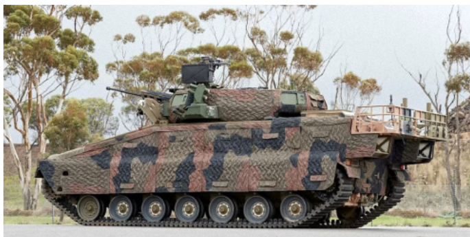
A mounted mobile camouflage system.

CBG Systems will supply SolarSigmaShield Mobile Camouflage Systems for the Australian Army's Redback infantry fighting vehicles under Project LAND 400 Phase 3.