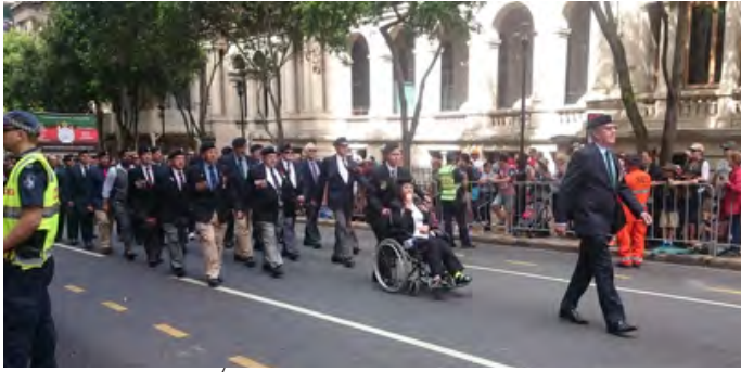
Anzac Day Parade 2016