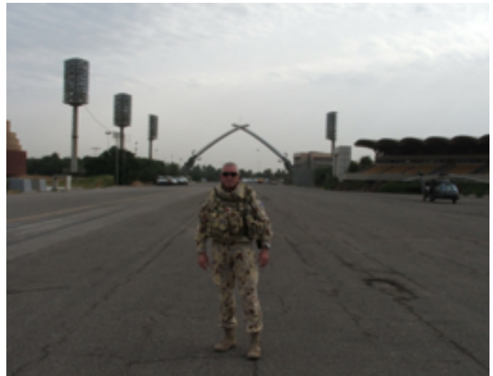
Below: Saddam's Parade Ground Baghdad 2006