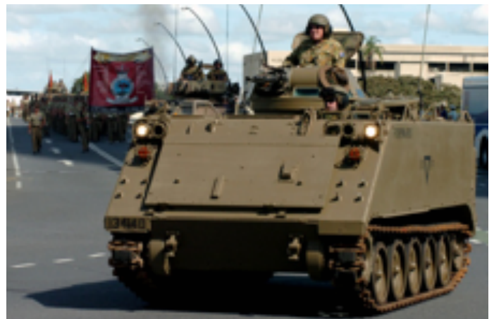
Above: Last time in a M113 turret. Leading the Regiment on ANZAC Day 2009