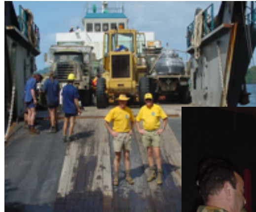
Above: OC and RSM FET OP BELISI Bougainville 2001